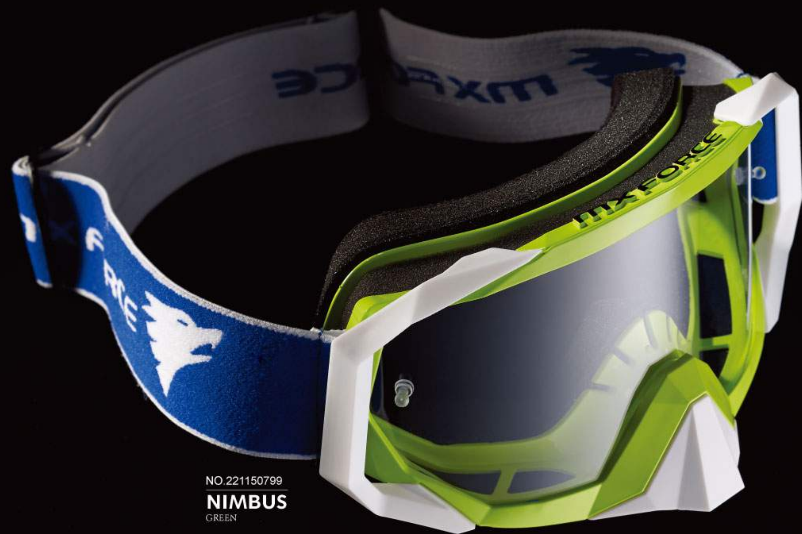
NO.221150799 NIMBUS GREEN