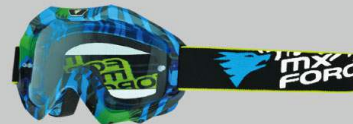
NO.225140199 MAGEN TIDE BLUE