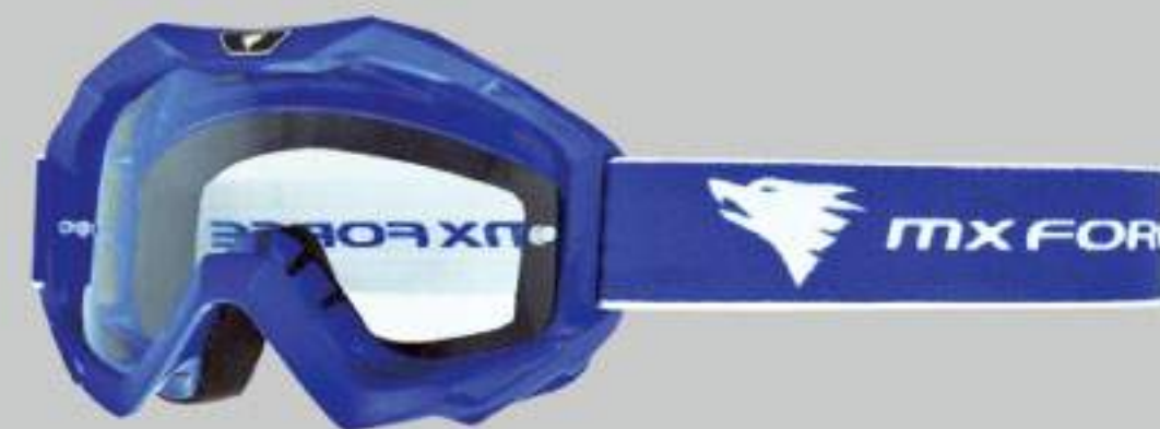
NO.221140199 MAGEN BLUE