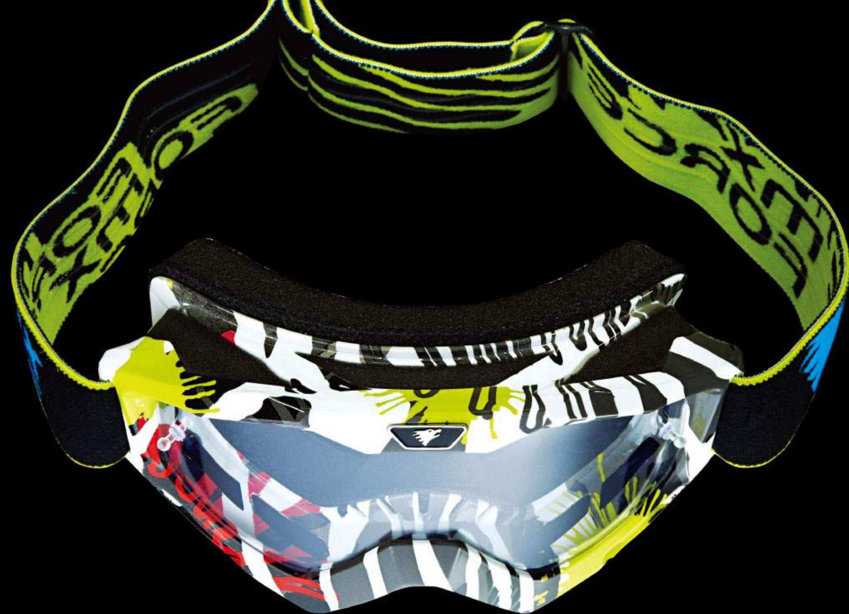
NO.225140699 MAGEN TIDE WHITE