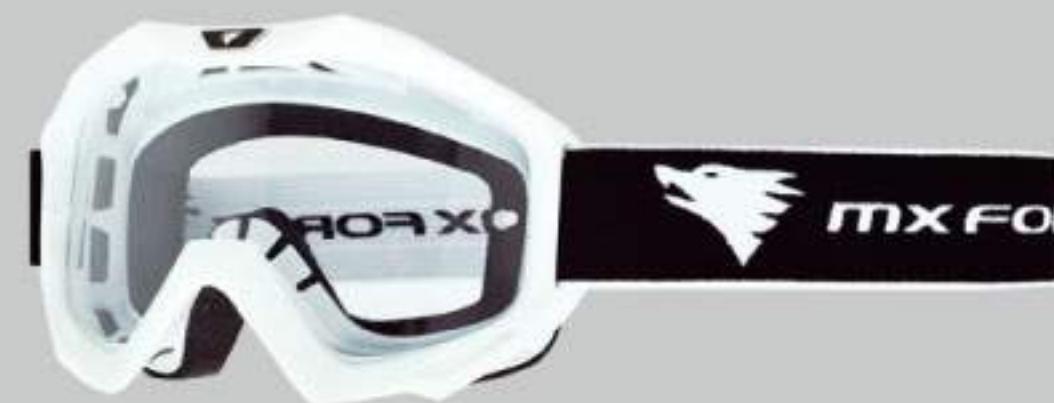
NO.221140699 MAGEN WHITE