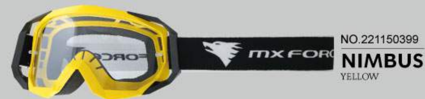
NO.221150399 NIMBUS YELLOW