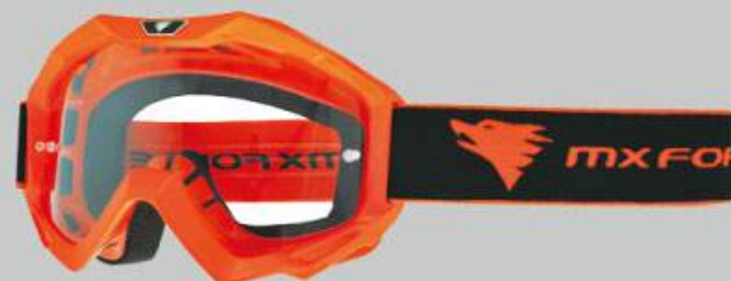
NO.221140599 MAGEN ORANGE