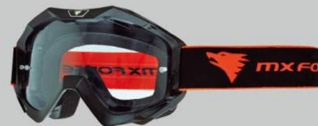
NO.221140299 MAGEN BLACK