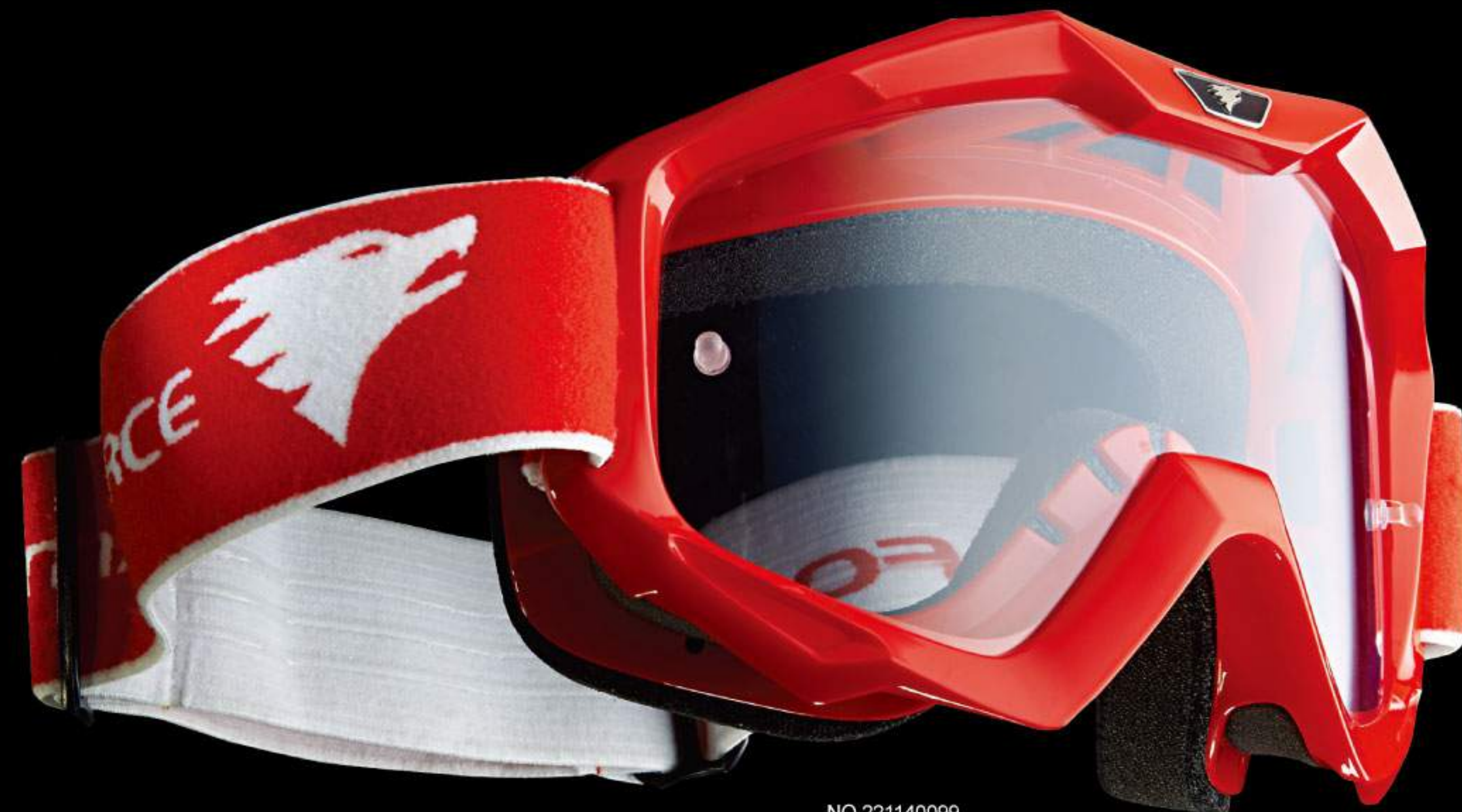
NO.221140099 MAGEN RED