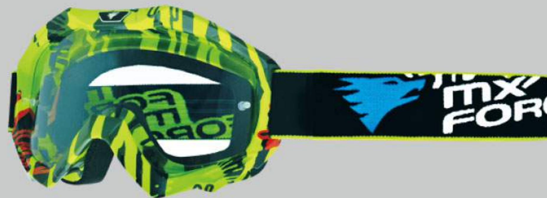
NO.225140799 MAGEN TIDE GREEN