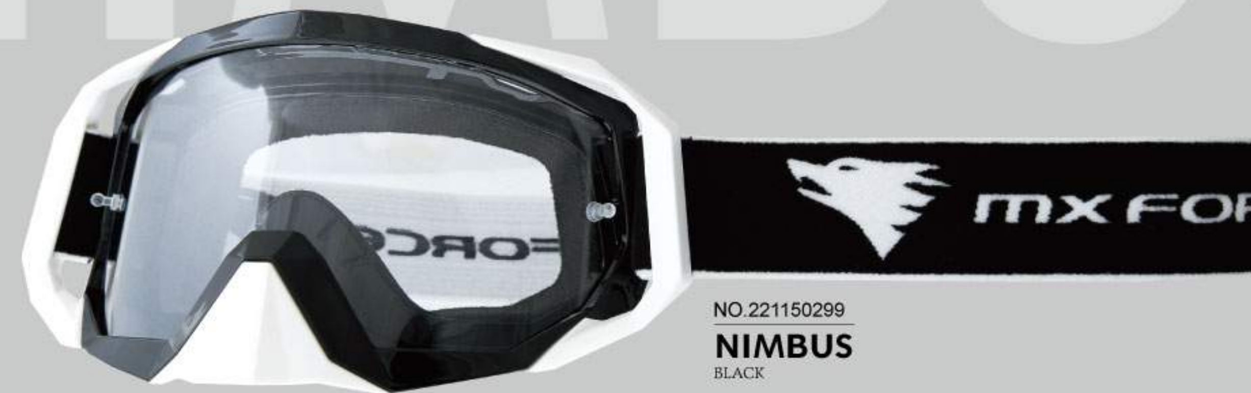
NO.221150299 NIMBUS BLACK