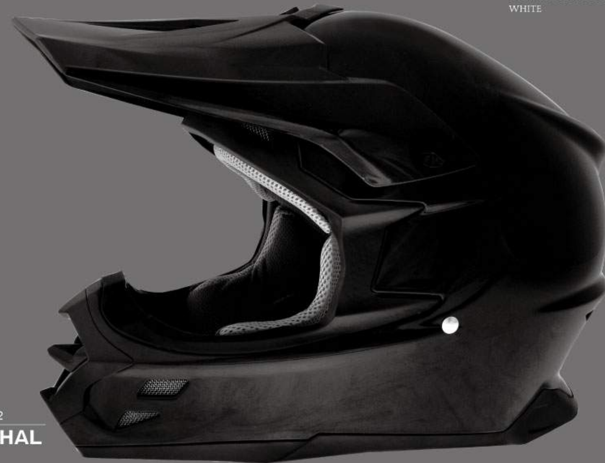
NO.1311406 MARSHAL WHITE